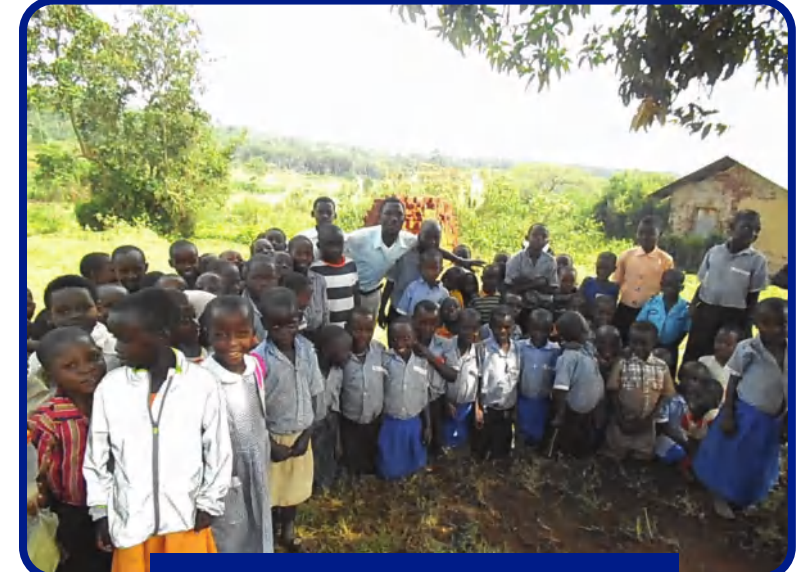
Children supported under our Education program