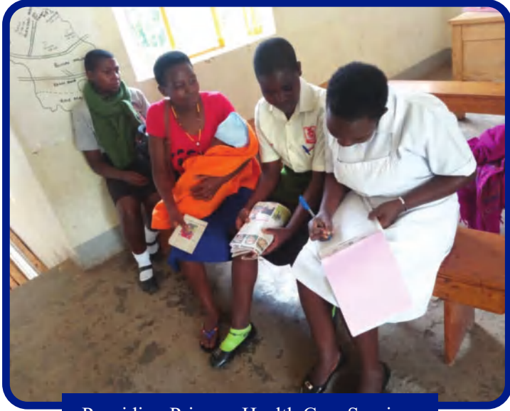
Providing Primary Health Care Services

LEADERSHIP OF ADCSAP-UGANDA ADCSAP-Uganda has a general assembly which comprises of the key stakeholders. The general assembly is conducted once a year (at the end) to reflect on the work done in the year as well as plan for the subsequent year. The general assembly is an interactive and consultative process where the SWOT of the organization is done and recommendations drawn to improve the performance of the organization.